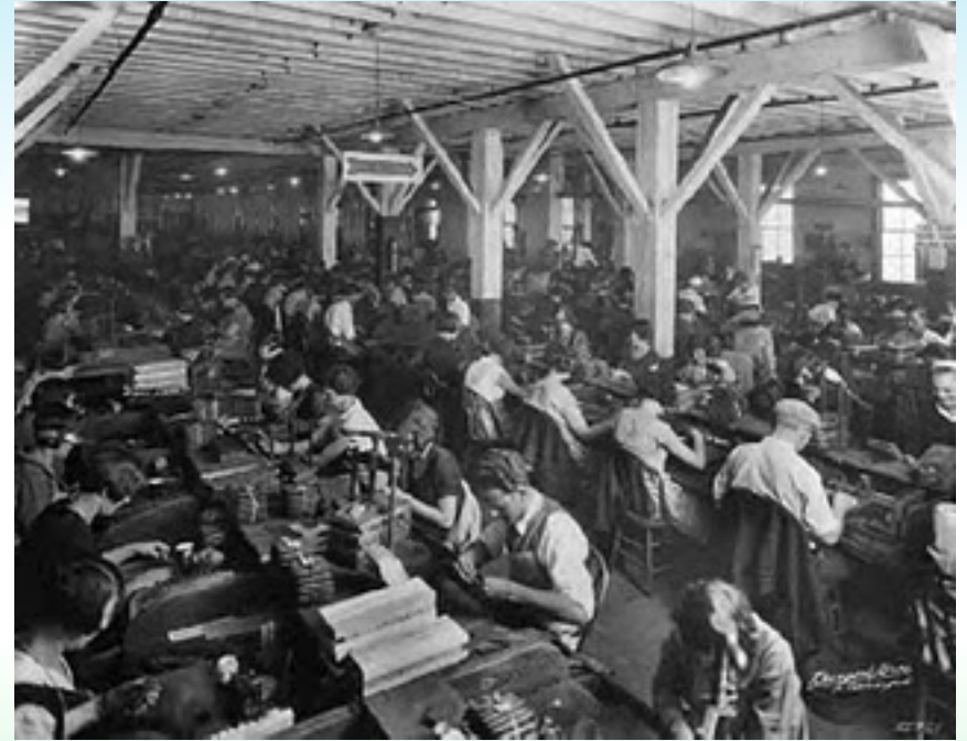
People moved to the city to find work while in the recession